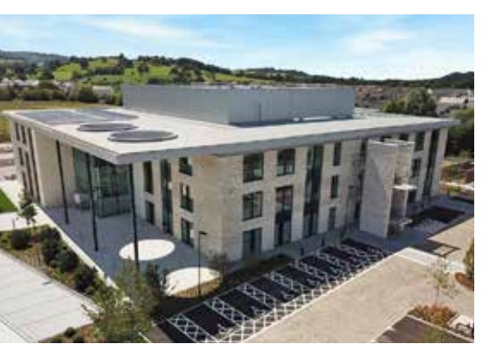
Ecclesiastical's office in Gloucester

As one of the UK's leading funeral plan providers and part of the Benefact Group, Ecclesiastical Planning Services works with funeral directors across the country, providing a safe home for your funeral plan pre-payment funds. The specialist UK-based financial services group of which Ecclesiastical Planning Services is part, has been protecting people, property and funds since 1887 and offering funeral plans since 2006.