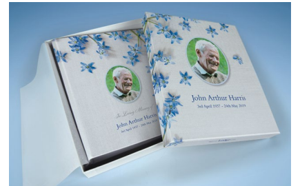
PERSONALISED MEMORIES BOX