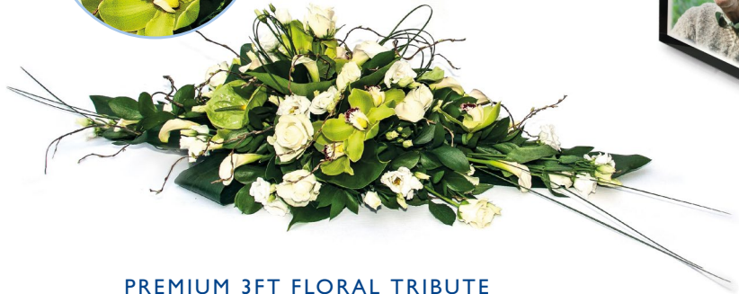
PREMIUM 3FT FLORAL TRIBUTE

TOUGHENED GLASS FRAMED PHOTO OF YOUR LOVED ONE