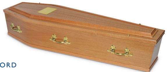
OXFORD Alternative coffin with raised lid.