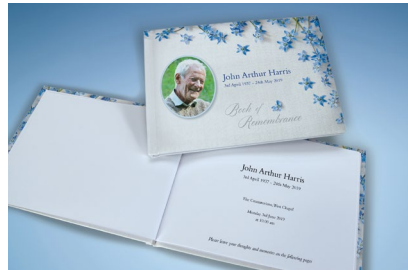
PERSONALISED BOOK OF REMEMBRANCE